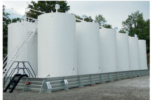
SITEGUARD secondary containment systems have been installed in more than 8,000 locations with a 100% environmental success rate.

Each system is custom built to fit your site and SPCC requirements. The SITEGUARD seamless secondary containment system is backed with an 18-month warranty.