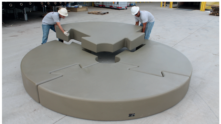
Cone bottom interlocking tank base

The unique interlocking design requires no tools to install. Typically, unpacking and installing a tank base takes no more than 5 minutes. Its light weight easily allows small adjustments just before tank setting, which reduces the need for crane level adjustments.